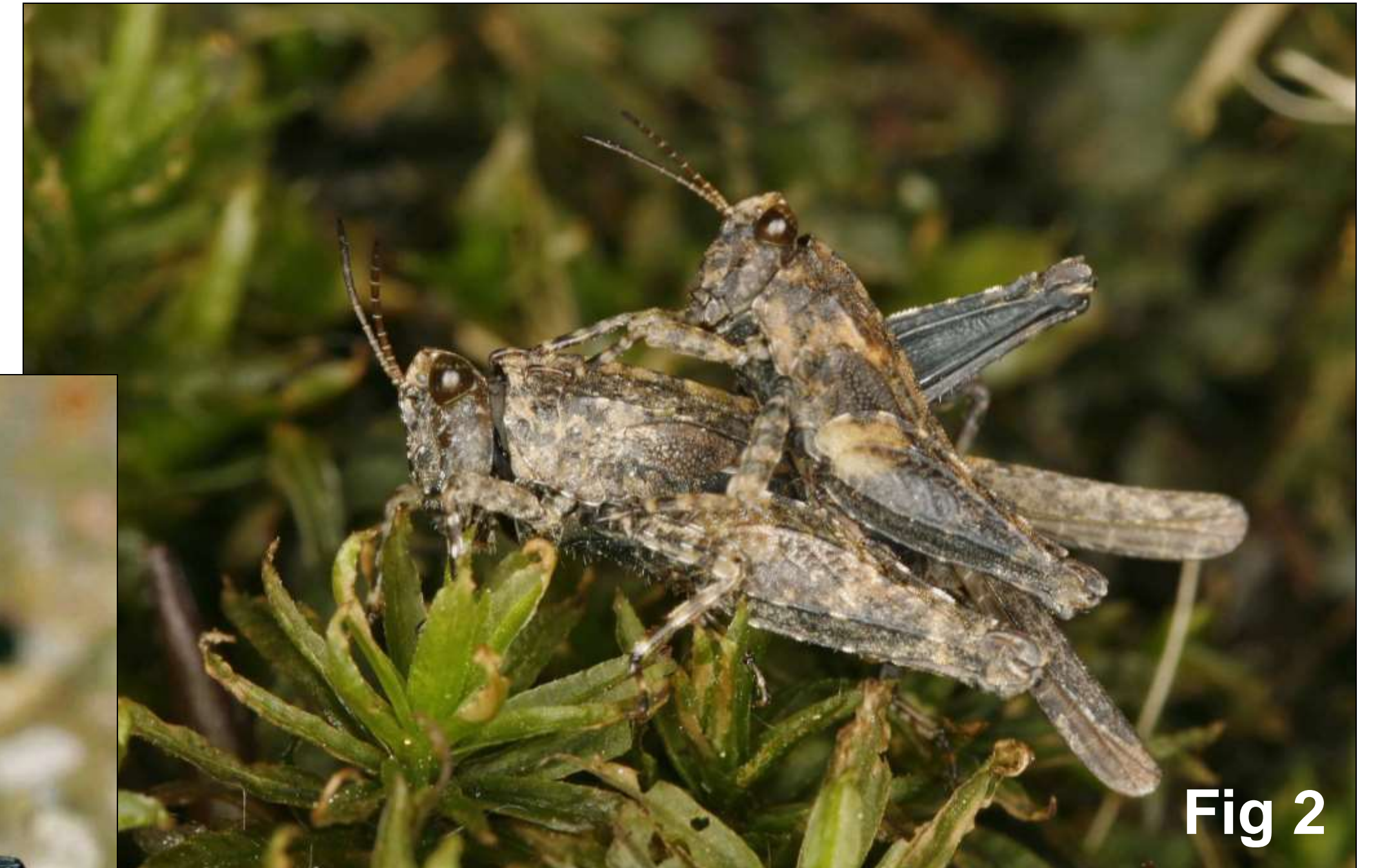
Figs 1, 2: Tetrix ceperoi (Bolivar, 1887) is a West-Mediterranean species, which reaches the north-eastern edge of its range in Central Europe. In the Czech Republic, the species has been reported for the first time in 2002 and up to now we know only few localities in southern Moravia. T. ceperoi is restricted to damp, warm habitats, such as dune valleys, sand pits or heath ponds and it prefers sand substratum. Fig. 1: female on typical substratum; Fig. 2: pair in copula feeding on Atrichum undulatum